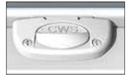
6500 Series Automatic Self-Locking Sash Locks

Double Applied also available (interior and exterior for depth)