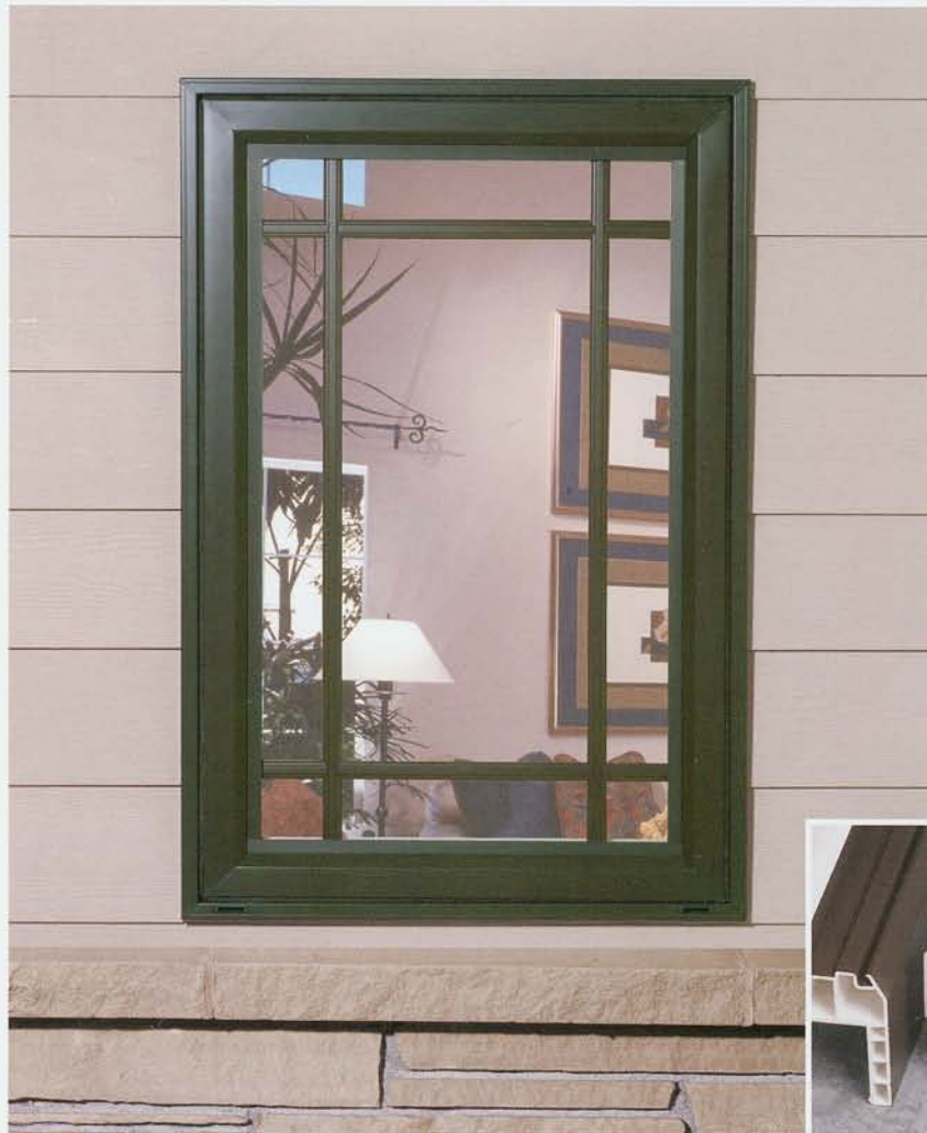
Shown in PVC SuperCapSR Hunter Green